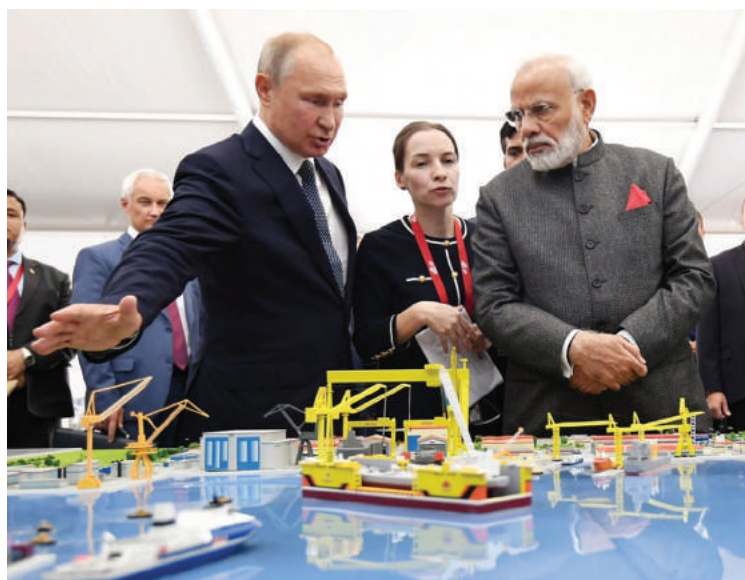
Vladivostok: Prime Minister Narendra Modi and Russian President Vladimir Putin at the Zvezda ship-building facility on Sep 4, 2019. The facility, located in Russia's Far East is being expanded.

Indian Prime Minister Narendra Modi's recent visit to Russia's far eastern city of Vladivostok on September 5th to attend