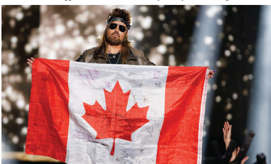
Billy Ray Cyrus holds up a Canadian flag at the end of Canadian Country Music Awards in Calgary, Sunday, Sept. 8, 2019.

Amazon is an Equal Opportunity - Affirmative Action Employer Minority / Women / Disability / Veteran / Gender Identity / Sexual Orientation / Age